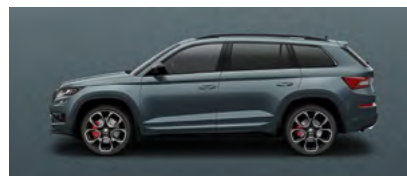
QUARTZ GREY METALLIC