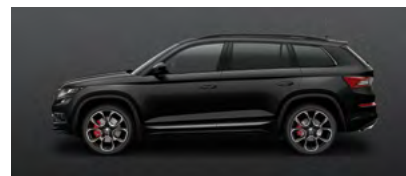
MAGIC BLACK PEARL

Please note that metallic and pearl effect paint are optional at extra cost. The print process does not allow for exact reproduction of the exterior or the upholstery colours. Please contact your ŠKODA Dealer for further information on colours and upholstery combinations. °Leather appointed seats have a combination of genuine and artificial leather, but are not wholly leather.